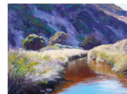
Sung Cove, Kangaroo Island Trevor Newman