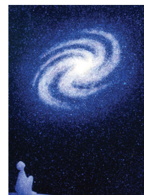
Watching a Galaxy, Acrylic on Canvas